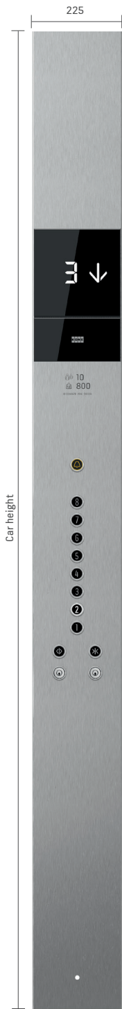
KSC 220 Full height COP, flush mounted